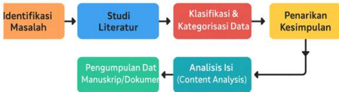
Diagram 2.1. Alur Penelitian

The above research flow describes the methodological approach used to ensure the consistency of scientific logic in literature research. Each stage is continuous in forming a solid conceptual analysis framework. Thus, the results of the resulting research have theoretical validity that can be accounted for academically and contextually to contemporary da'wah studies (Abbas, 2023).